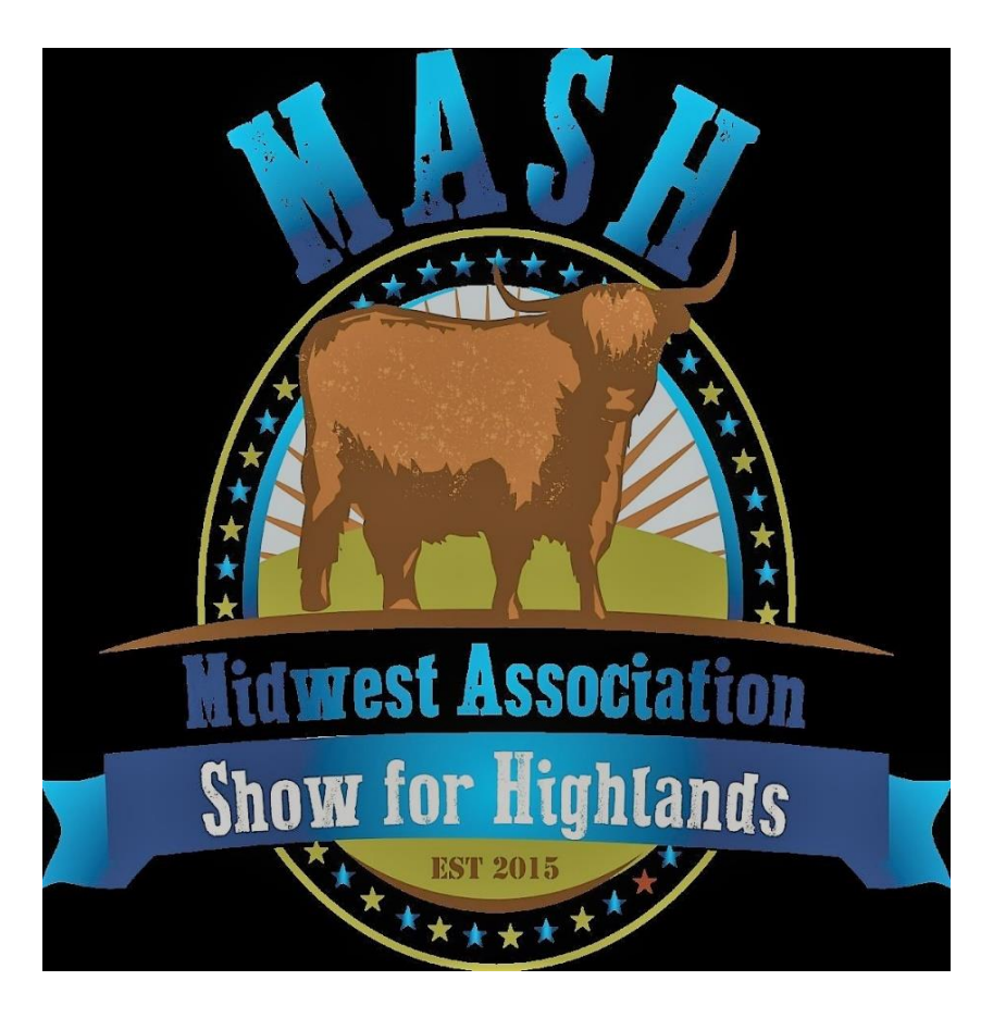
Michigan State Fair, Novi, Michigan September 3, 2022